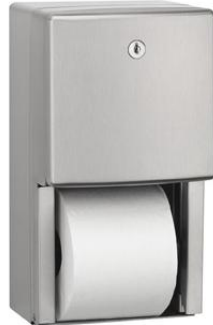
PR0700CS Satin finish